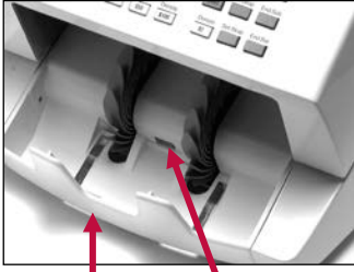
Stacker mirror Stacker-sensor lens

Use a microfiber towel to clean the stacker-sensor lens located in the stacker tray between the two gray stacker wheels.