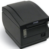
Thermal printer (other printers available)

Dimensions: 13.5"W x 13"D x 9.5"H (without hopper).