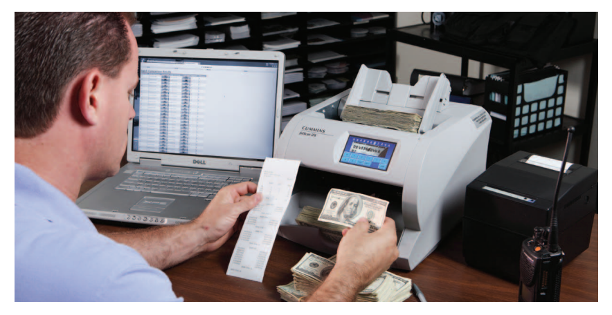
The JetScan iFX generates a print-out detailing the count and serial number.

"Plus if the seizure takes place during a banking day, we can deposit the