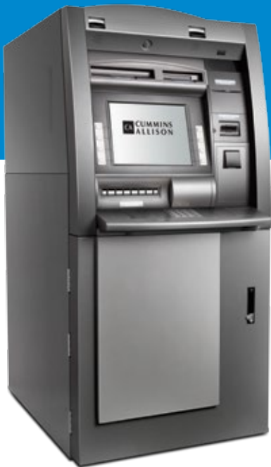
Lobby, walk-up and drive-up models available

As the anchor of a multi-channel delivery strategy, having your ATMs available in multiple locations and in the most user-friendly configurations is key to meeting your customer's needs.