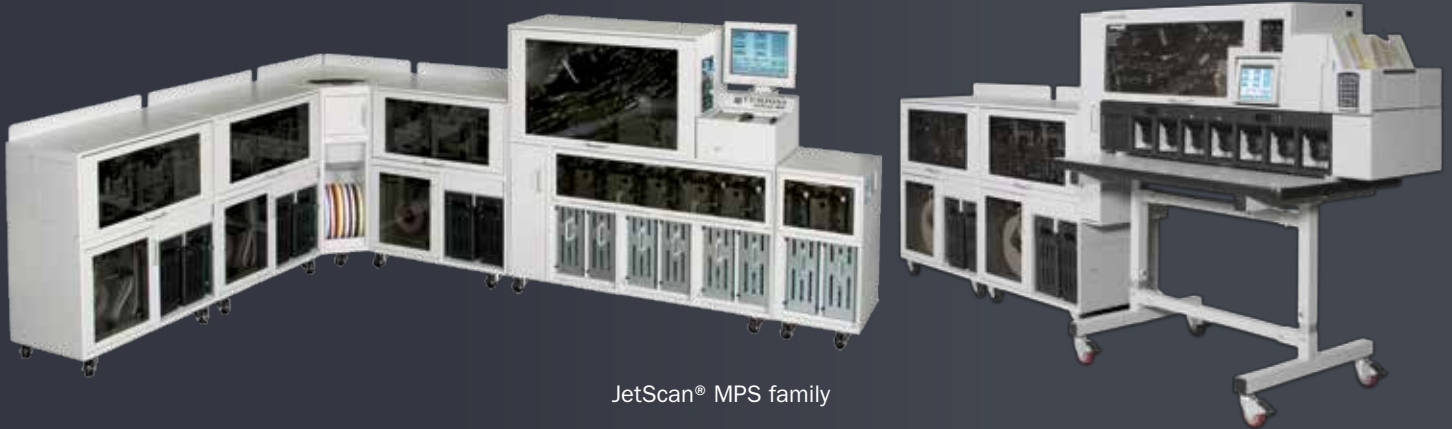
JetScan® MPS family

Desktop, countertop and floor model solutions