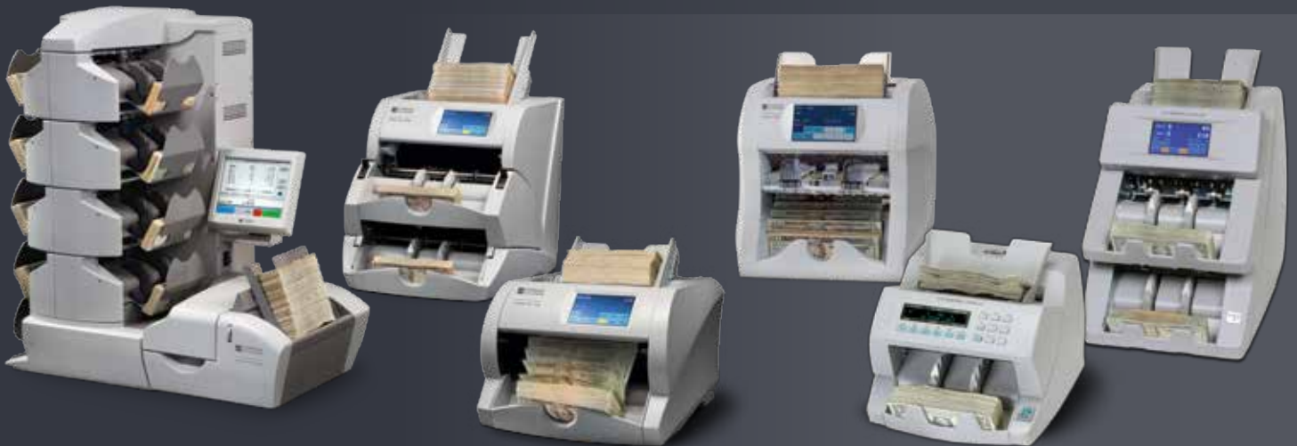
JetScan iFX® family