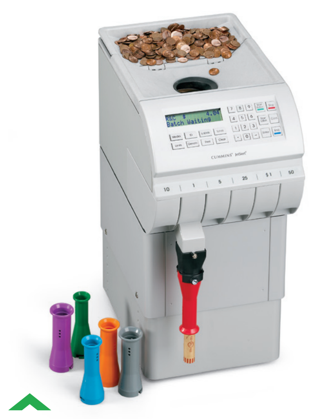
JetSort® 1000 effectively complements self-service coin counter machines by processing coin quickly and packaging rolls to eliminate rolled coin fees.