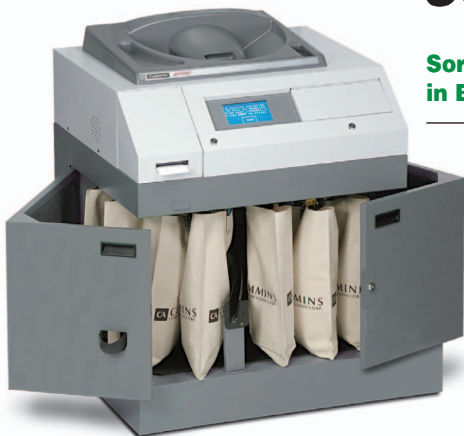
Sorted Coins in Bags