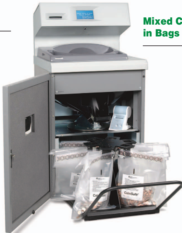
Mixed Coins in Bags